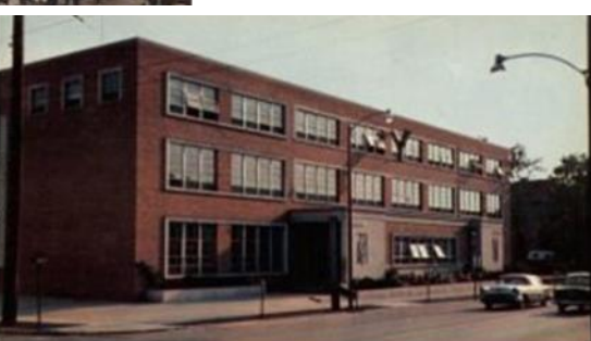
1953 Site of second Marion Family YMCA on Church Street