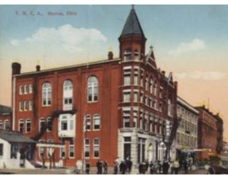
1892 Site of first Marion Family YMCA on South State Street

In 2004 the Marion Family YMCA moved to its current location on Barks Road. Through the tool of this 88,000 square foot facility we are helping more youth reach their potential, aiding more individuals and families in improving their well-being, and providing more opportunities for people to give back and support their Marion neighbors.