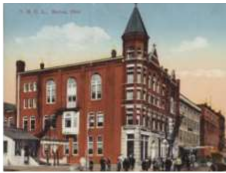
1892 Site of first Marion Family YMCA on South State Street

In 2004 the Marion Family YMCA moved to its current location on Barks Road. Through the tool of this 88,000 square foot facility we are helping more youth reach their potential, aiding more individuals and families in improving their well-being, and providing more opportunities for people to give back and support their Marion neighbors.