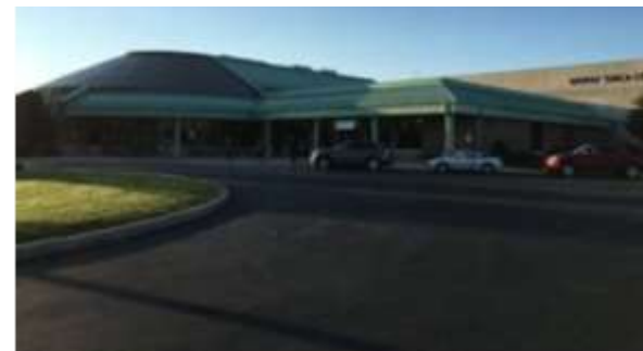
2004 Current Marion Family YMCA on Barks Road