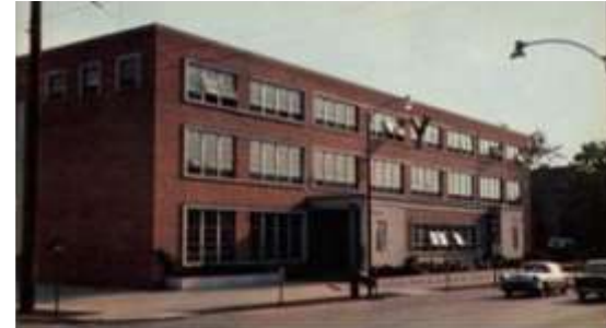
1953 Site of second Marion Family YMCA on Church Street