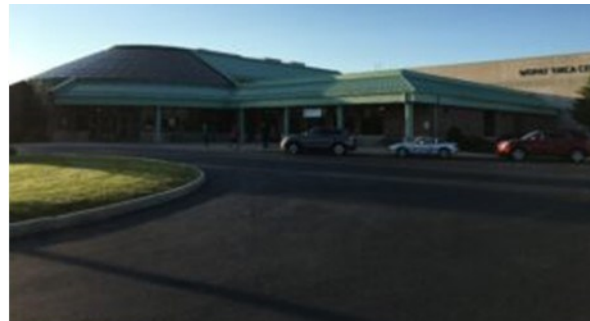
2004 Current Marion Family YMCA on Barks Road