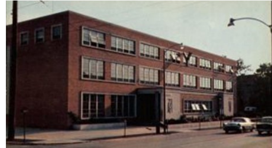
1953 Site of second Marion Family YMCA on Church Street