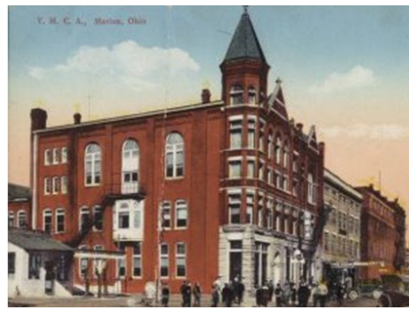
1892 Site of first Marion Family YMCA on South State Street

In 2004 the Marion Family YMCA moved to its current location on Barks Road. Through the tool of this 88,000 square foot facility we are helping more youth reach their potential, aiding more individuals and families in improving their well-being, and providing more opportunities for people to give back and support their Marion neighbors.