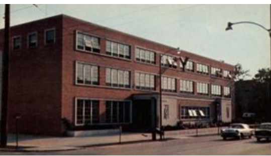
1953 Site of second Marion Family YMCA on Church Street