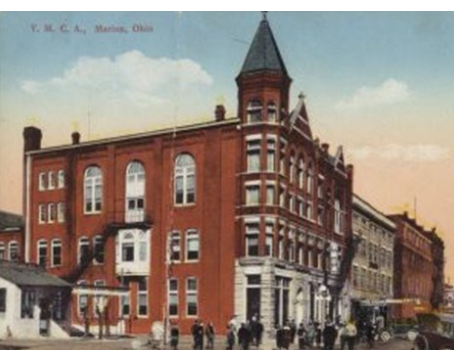
1892 Site of first Marion Family YMCA on South State Street

In 2004 the Marion Family YMCA moved to its current location on Barks Road. Through the tool of this 88,000 square foot facility we are helping more youth reach their potential, aiding more individuals and families in improving their well-being, and providing more opportunities for people to give back and support their Marion neighbors.