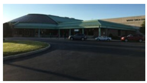
2004 Current Marion Family YMCA on Barks Road